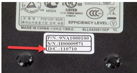
The above example shows a date code (D/C) of 110710

The replaced and unaffected PSUs will have a date code greater than 1300000. (YYWWxx, where YY=year and WW=week)