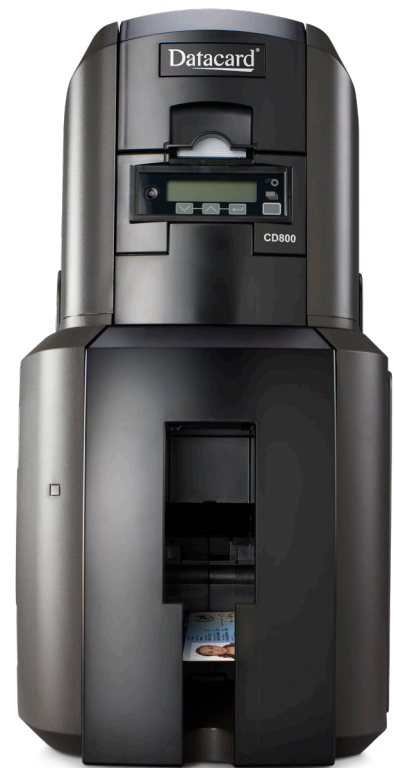
Datacard® CD800™ Card Printer with inline lamination module