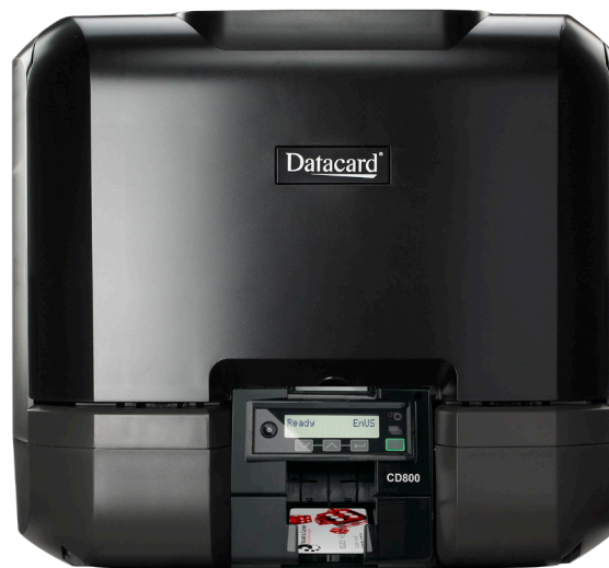
Datacard® CD800™ Card Printer with optional multi-hopper