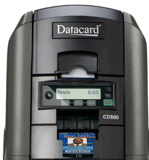
Datacard® CD800™ Series Card Printer