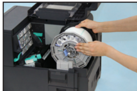
Easy label roll replacement