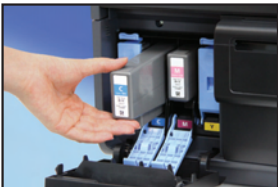
Simple ink cartridge replacement

* Specifications subject to change without notice