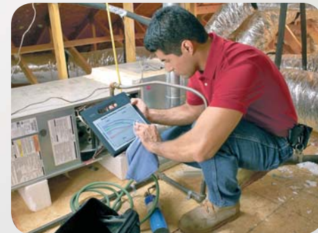
Easily clean the rugged F5 while working in harsh environments.

The Motion F5 features a built-in camera, a standard Radio Frequency (RFID) reader and a barcode scanner to document and diagnose work day problems. Scan tagged equipment to determine model and specification information and photograph your project before and after to document work. Coordinate numerous subcontractor jobs on site without worry of harsh conditions like dust, dirt and moisture. The rugged, quick cleaning design of the F5, which is IP54 rated, gives you confidence to do your job in any situation.