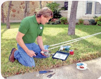
Take your F5 with you no matter where your work takes you.

No longer do you have to sacrifice size and weight for outstanding performance. Weighing approximately 3 pounds with an integrated handle, this ergonomic tool is ideally suited to complement your demanding work day. The Motion F5 rugged Tablet PC offers true mobility with the Intel® Core™2 Duo processor and optional integrated mobile broadband.