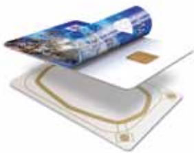
High Definition cards deliver superb image quality on smart cards. HDP Film conforms to the uneven surface created by embedded electronics.

This re-transfer technology seals the card image under the HDP Film, and provides three essential benefits for financial cards: First is over-the-edge printing, which replicates the look of pre-printed cards. Durability is second, with HDP Film protecting the printed image from rubbing off the card. And third is fraud protection. HDP Film is inherently tamper evident. Any attempt to peel apart the card layers instantly damages the card image.