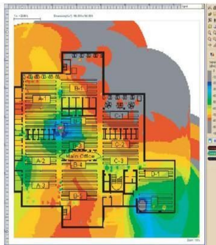
AirMagnet Survey Signal Analysis